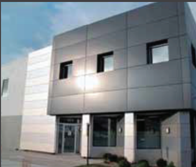
Aluminium Composite Panel-ACP