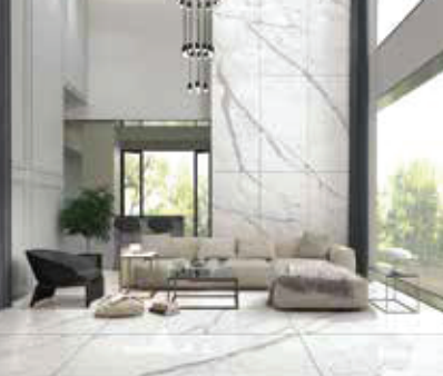
Big Slab Tiles