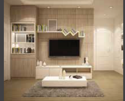
High Pressure Decorative Laminates