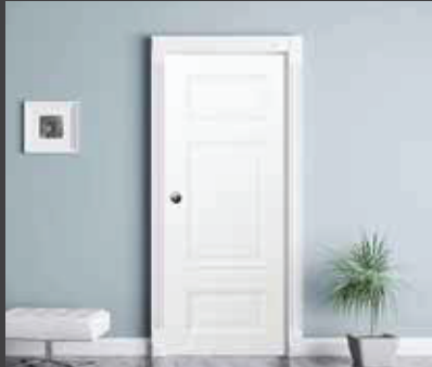
PVC/WPC Foam Sheet-Door